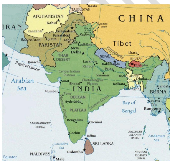
Map 01: The strategic importance of South Asia

The South Asian region has been a focus of academic research and policy analysis for decades due to its strategic importance (as shown in map 1) and economic potential. Regional integration has been identified as a critical strategy for promoting the region's economic growth and political stability. However, South Asia has faced numerous challenges in achieving meaningful regional integration, including political conflicts, trade imbalances, infrastructure deficiencies and divergent economic policies (P.V. Rao, 2012). Studies have revealed that numerous issues have plagued the South Asian region due to the absence of proper regional integration. The lack of economic and political cooperation between the countries in the region has resulted in several challenges that have hindered the growth and development of the region.