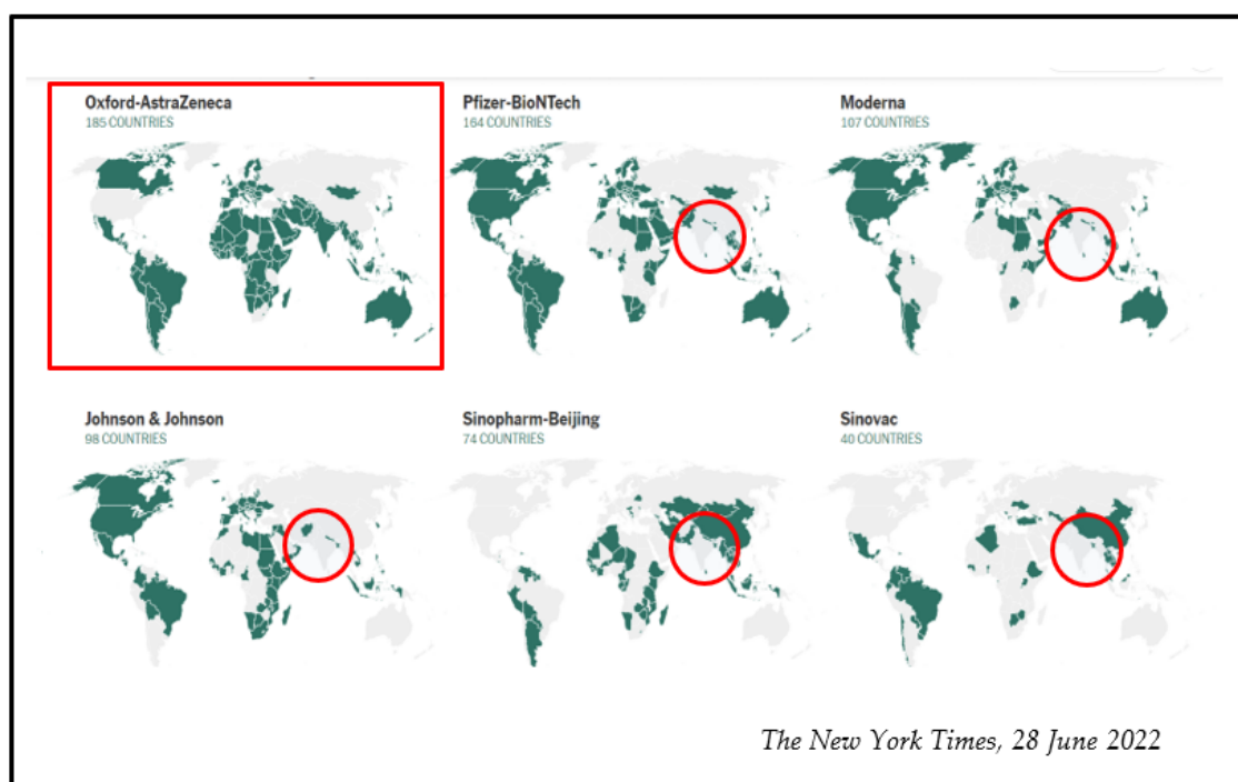
Figure 1. Geographical expansion of major Vaccine productions in the world

imported energy, particularly between China and India (Congressional Research Service, 2018). However, in the light of the current economic hurdles posed by the COVID-19 pandemic, vaccine diplomacy has become a means of power distribution for both countries. As a result, the COVID-19 vaccine has now become a 'public good' for China and India in the Asian-Pacific region which demonstrates their global and regional power. In this context, India, the USA, and China have developed a competition centered on Asian, African, and Caribbean markets in order to grip the majority of countries in the global South through vaccine diplomacies at present. The maps below (Figure 1), shows the expansion of vaccine competition created by the major vaccine producers in the world including India.